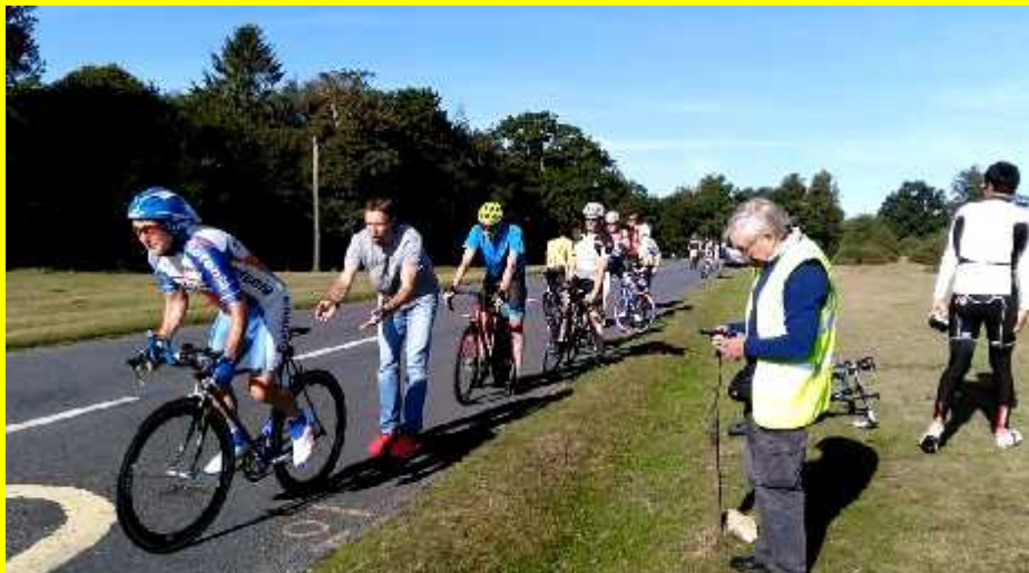
Crabwood CC had a special guest at their club 10 in September. Chris Summers (Sotonia CC & VTTA Wessex) is pushed away by Jens Voigt, former professional but still a superstar