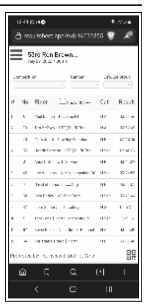
Screenshot of ResultSheet when viewed on a mobile phone

It's free to use and you can sign up via the ResultSheet website: https://resultsheet.co.uk/