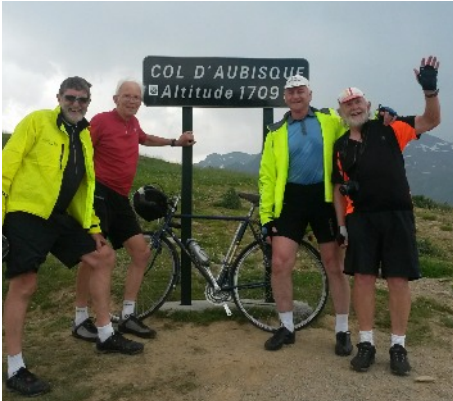
'Last of the Summer Wine' on tour