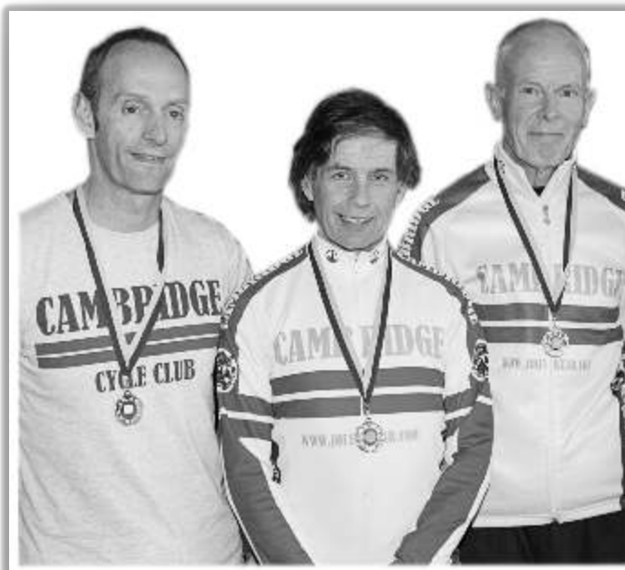
The Winning Team in the Championship 10