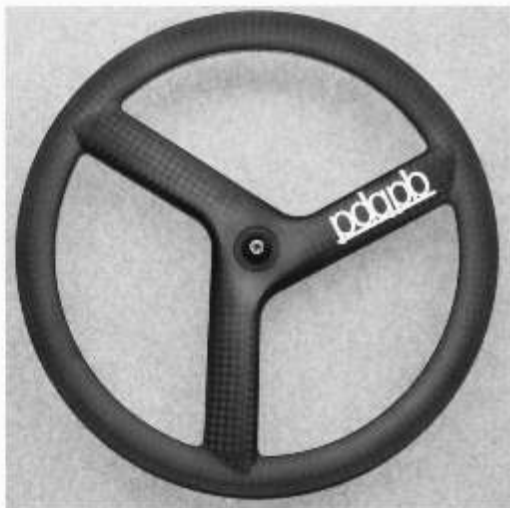
PDQ Full carbon trispoke. 710 gms! From only £499.99

Performance Driven Quality ... Pretty Damned Quick. Whichever way you look at it, these are seriously fast and superior quality products which have been tested and highly recommended by former multi national champion and record holder For more details go to www.iancammish.co.uk