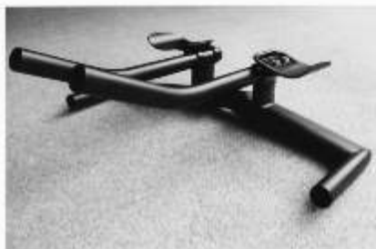
PDQ Full carbon time trial bars. Only £239.99