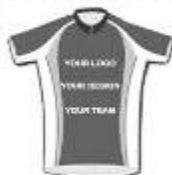
INSTANT QUOTE FOR TEAM CLOTHING

For full product and price list please contact us. Our quality is guaranteed.