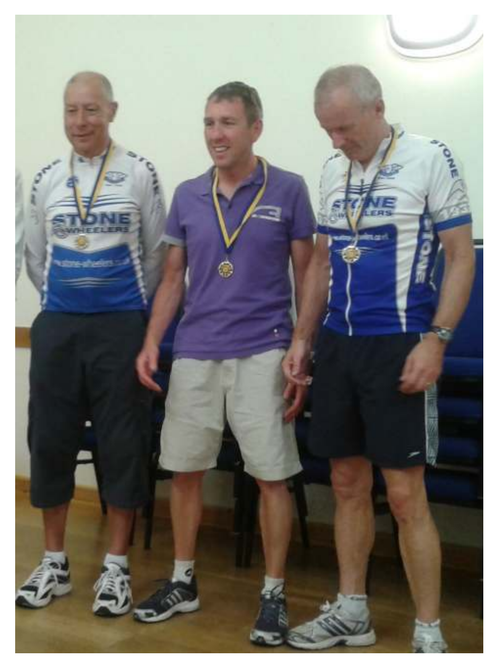
The Stone Wheelers Winning Team 100 Mile Championship