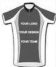
INSTANT QUOTE FOR TEAM CLOTHING

For full product and price list please contact us. Our quality is guaranteed.