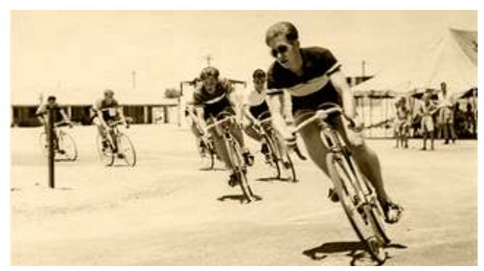
Canal Zone road race in Egypt in early 1950s