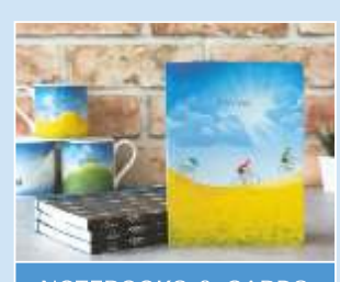
NOTEBOOKS & CARDS