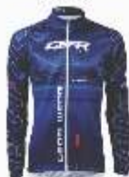
Winter AR2078 GBP 32