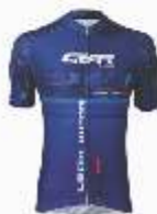
Classic AR2032 GBP 26