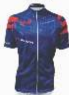
MTB AR2019 GBP 26