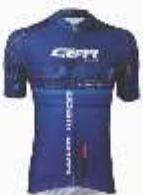
Classic Pro AR2185 GBP 32