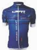
Asteria AR2029 GBP 35