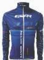
Roubaix AR2071 GBP 43