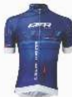
Elite AR2134 GBP 38