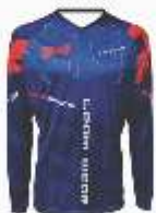
Downhill AR2041 GBP 30