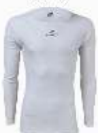
Baselayer AR2156 GBP 15