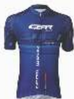
Classic Plus AR2124 GBP 26