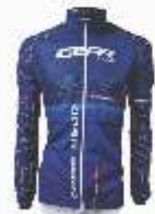
Jacket Light AR2072 GBP 35