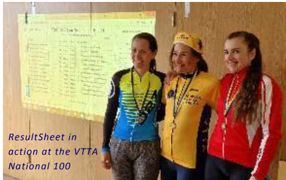
ResultSheet in action at the VTTA National 100

Once the event is complete and any queried times are corrected, organisers can export results and upload them to the CTT website without needing to rekey any data. The steps for club events are the same except the start