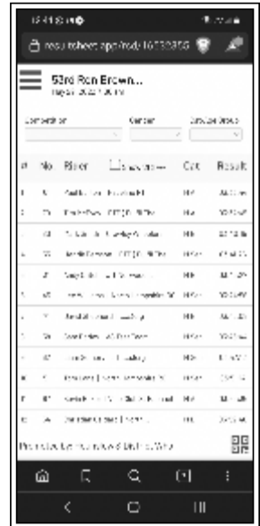
Screenshot of ResultSheet when viewed on a mobile phone

It's free to use and you can sign up via the ResultSheet website: https://resultsheet.co.uk/